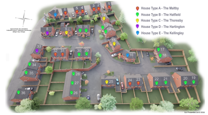
The Sidings - New Development - Langwith, Derbyshire