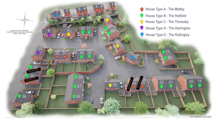
The Sidings - New Development - Langwith, Derbyshire